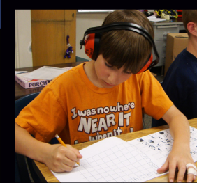
Noise Canceling Headset